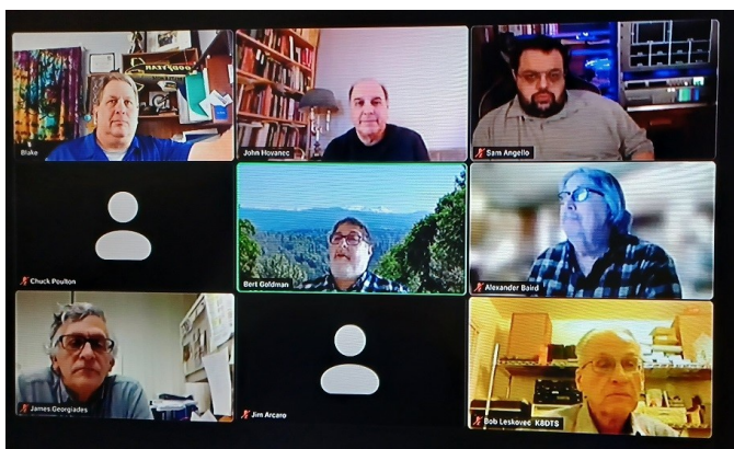
Screenshots courtesy of Blake Thompson