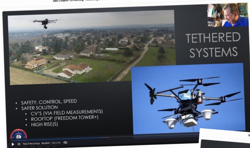
SBE Chapter 70 Meeting - Recording 2 - Shared screen with speaker view