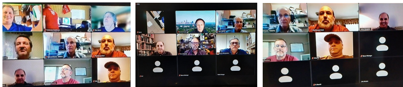
SBE Chapter 70 Meeting - Recording 2 - Shared screen with speaker view