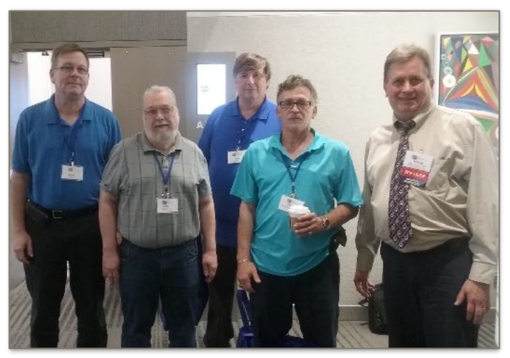
Chapter 70 members attending the OBMTC conference in Columbus last month.

The next SBE Webinar is on Thursday, October 19, 2017 2-3:30 p.m. on <u>Using Drones in Broadcast Operation</u>. Drones, or Unmanned Aerial Vehicles, are useful in several broadcast operations, including ENG, tower inspections, site documentation, signal measurements, and even training videos. During this hour-and-half webinar, we will explore these uses and discuss FAA requirements, including how to get your Remote Pilot