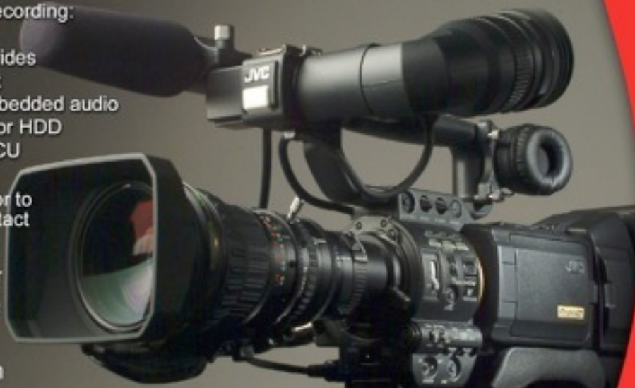
The GY-HD250 Studio-Capable ProHD Camcorder