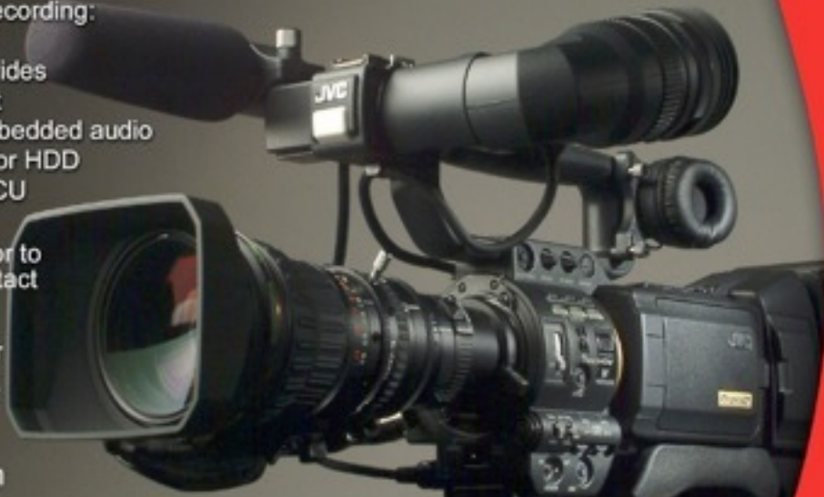
The GY-HD250 Studio-Capable ProHD Camcorder