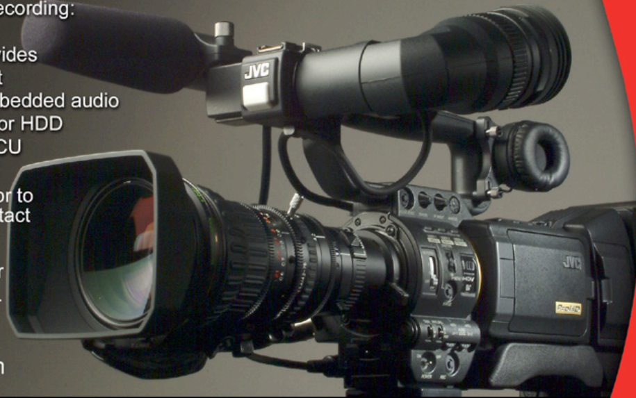
The GY-HD250 Studio-Capable ProHD Camcorder