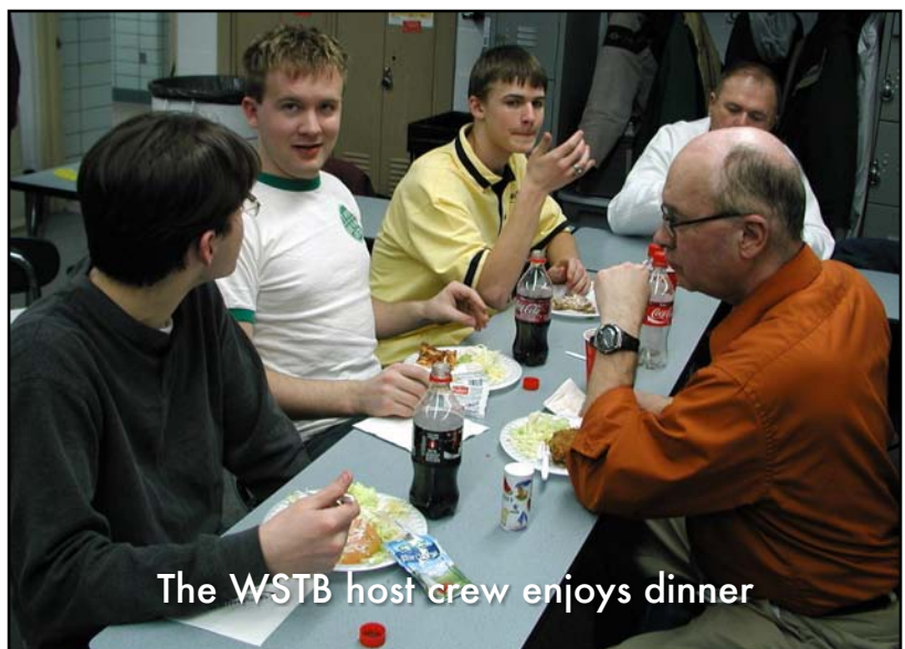
The WSTB host crew enjoys dinner