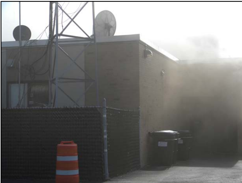
Above: Smoke pours from the hallway entrance to the radio station. The station is located directly behind the tower.

88.9/WSTB is owned by the Streetsboro City Schools and operates at 680 watts ERP with an antenna height of 373' on the Kent State University campus.