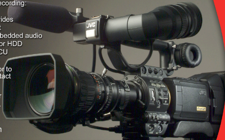
The GY-HD250 Studio-Capable ProHD Camcorder