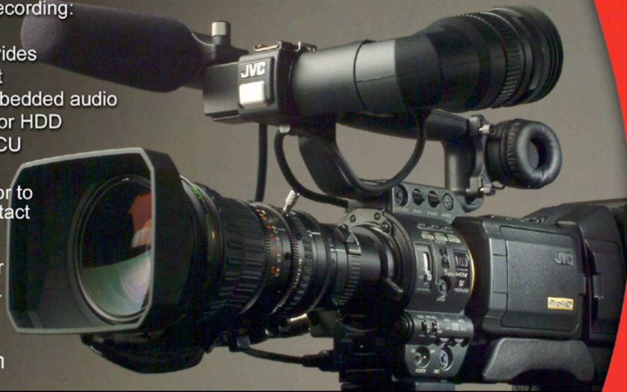
The GY-HD250 Studio-Capable ProHD Camcorder