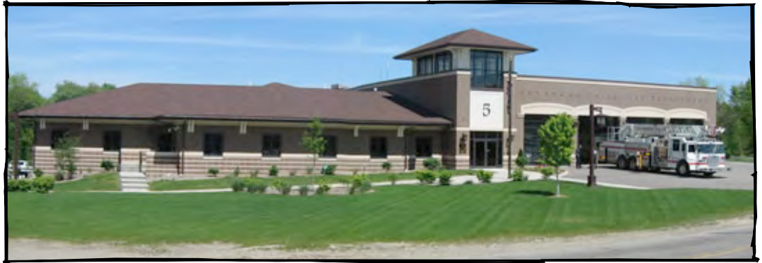
Here is what you are looking for. This is Cuyahoga Falls Fire Station #5. Park on the left side of the building.

The June 9 th SBE meeting will take place in Fire Station #5 in Cuyahoga Falls Ohio at 3497 Wyoga Lake Rd. 44221. Please use the north / side driveway for parking at the station. Do not park in front of the main doors! Also be aware that Google maps shows an empty field at the address listed until you use the street view, then it shows up just fine.