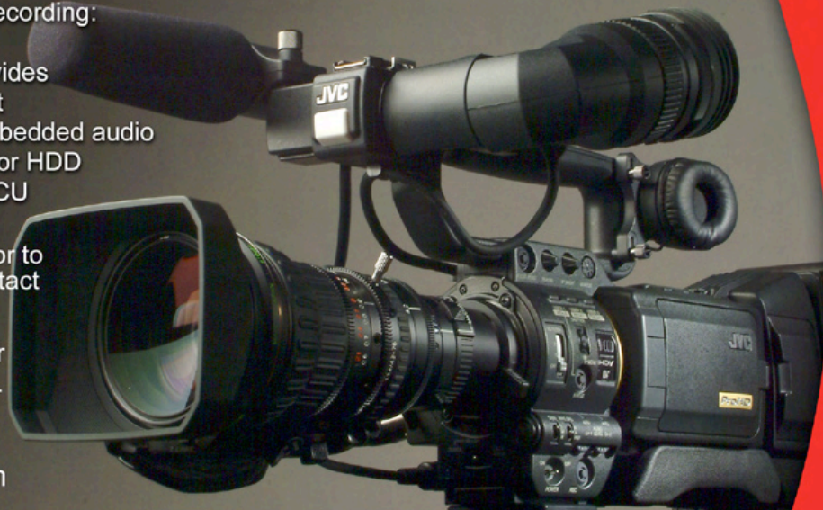
The GY-HD250 Studio-Capable ProHD Camcorder