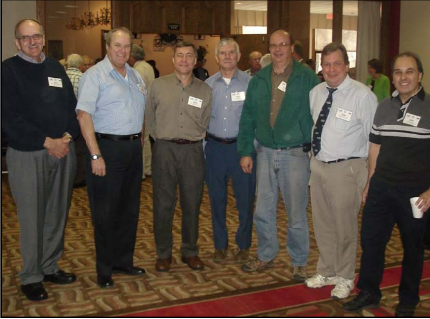
Chapter 70's delegation to the OAB Broadcast Engineering Conference in Columbus on November 17th