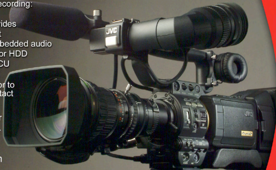
The GY-HD250 Studio-Capable ProHD Camcorder