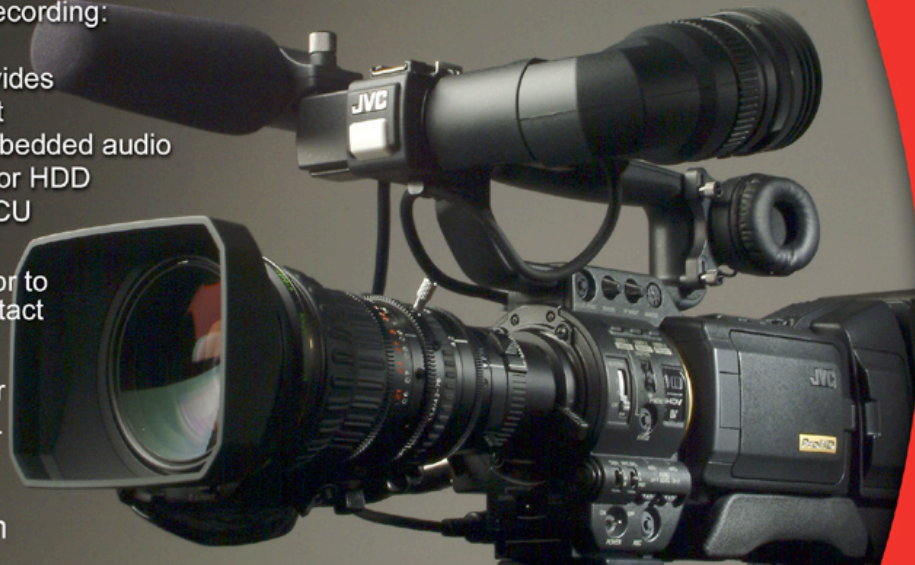
The GY-HD250 Studio-Capable ProHD Camcorder