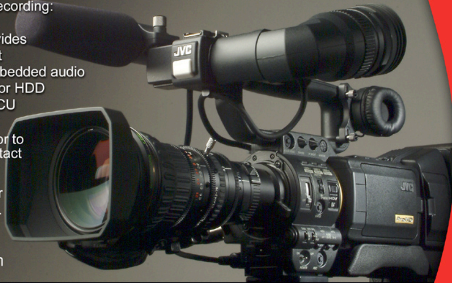
The GY-HD250 Studio-Capable ProHD Camcorder