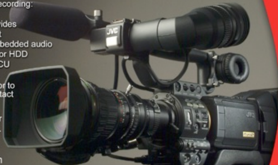
The GY-HD250 Studio-Capable ProHD Camcorder