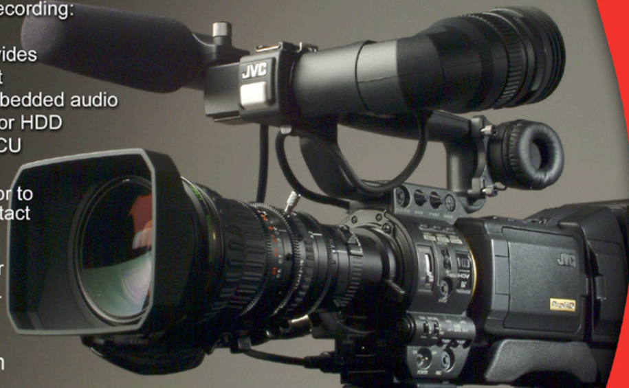
The GY-HD250 Studio-Capable ProHD Camcorder