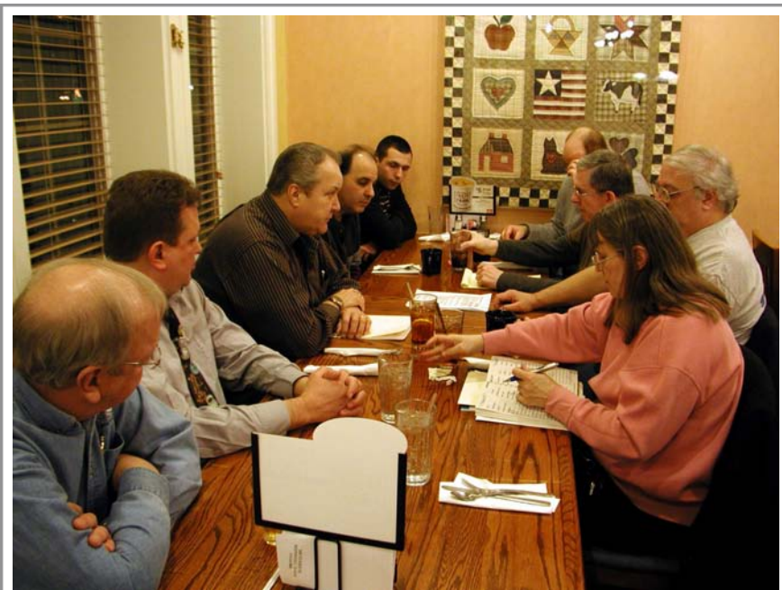
Chapter 70 January meeting at Bob Evan's Restaurant

The webinar is offered at no cost to OAB member stations, however pre-registration is required.