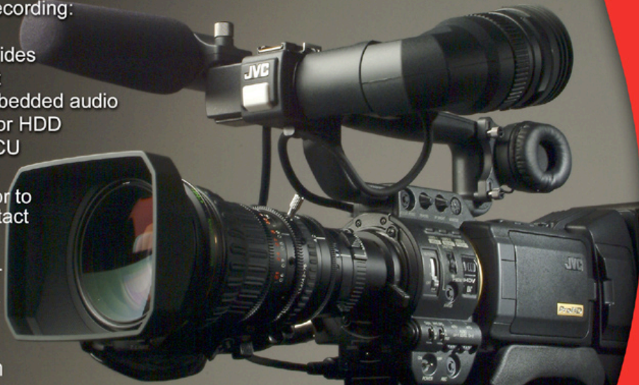
The GY-HD250 Studio-Capable ProHD Camcorder