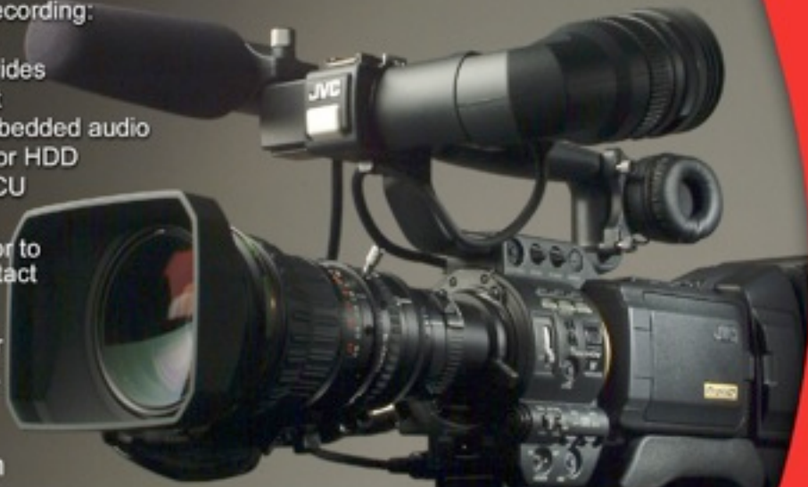
The GY-HD250 Studio-Capable ProHD Camcorder